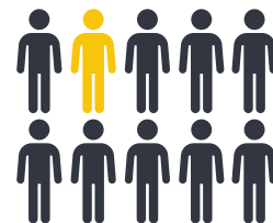
1 IN 10 SENIORS GO ONLINE ALMOST CONSTANTLY